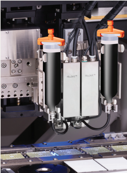
NuJet pumps pitched at 28mm

Q: Why is the DDH technology “unique” to other alternatives in the Market?